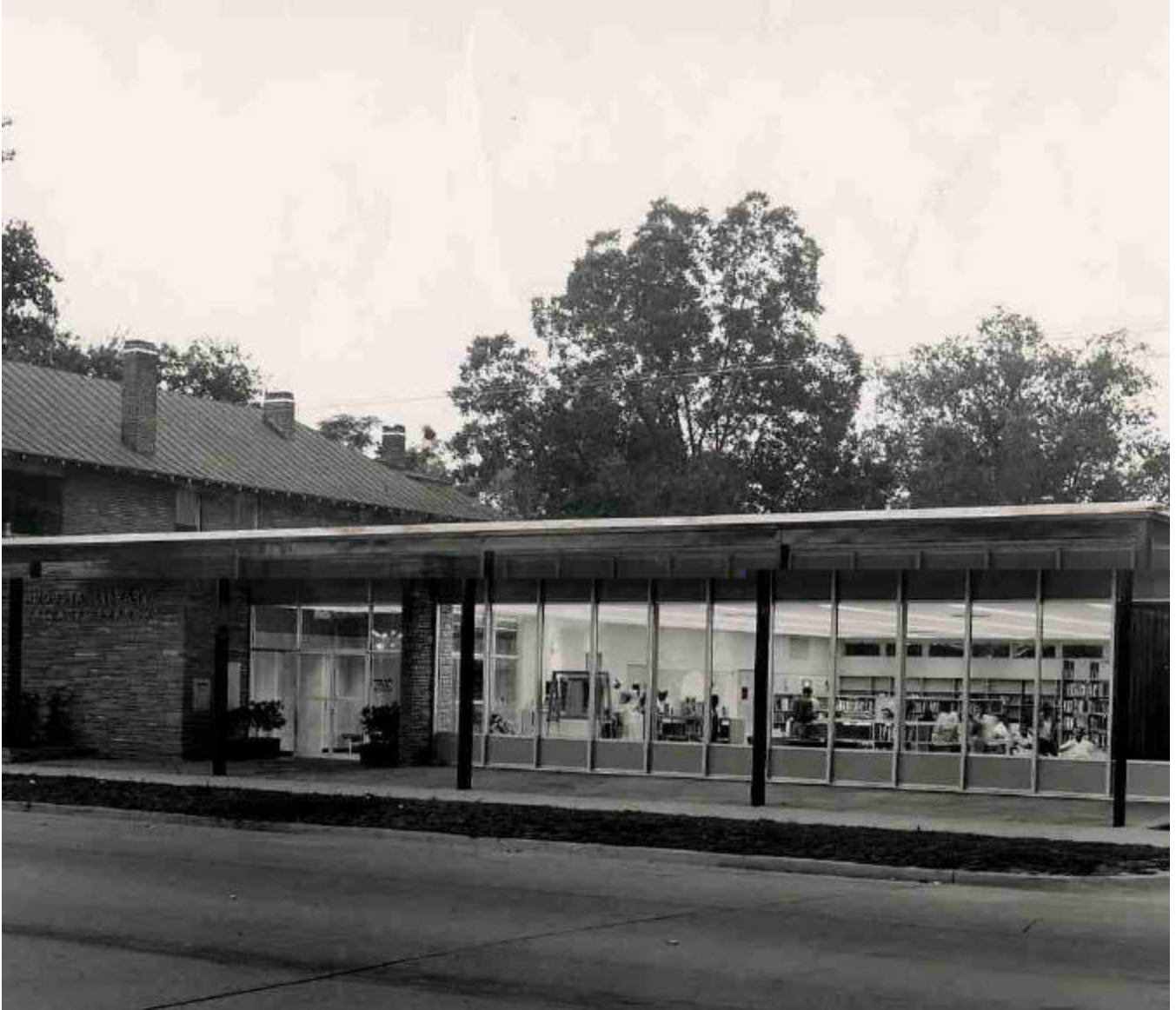
The Wallace Branch today.

So began a new era for Augusta's Library. By 1968, the focus was on library services rather than finances. Adult Education was one service the Library intended to provide. The 1968 Annual Report stated, "More and more across the country librarians are seeing their role in the community not just to interpret a storehouse of information but as active agents, teaching individuals and groups how to use the library, seeking to bring people of all ages and educational levels into the library and reaching into low income