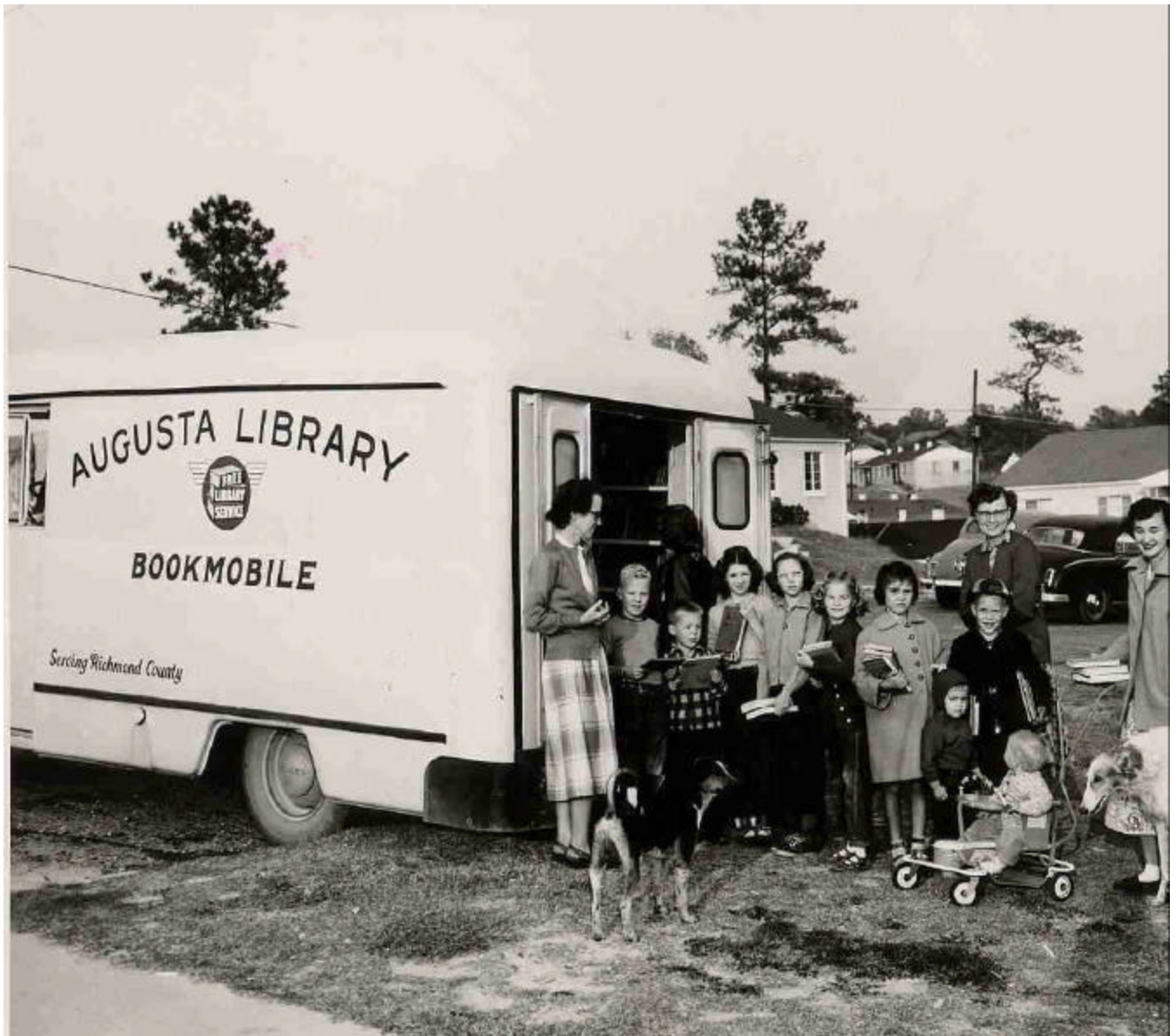
The Augusta Library Bookmobile in the early 1950s.

Accordingly, a contract was made between the Augusta Library and Columbia County Board of Education, thus forming a two-county regional library. Shortly after this, Augusta officials provided additional funds for the operation of this new Vannette bookmobile within the city limits of Augusta.