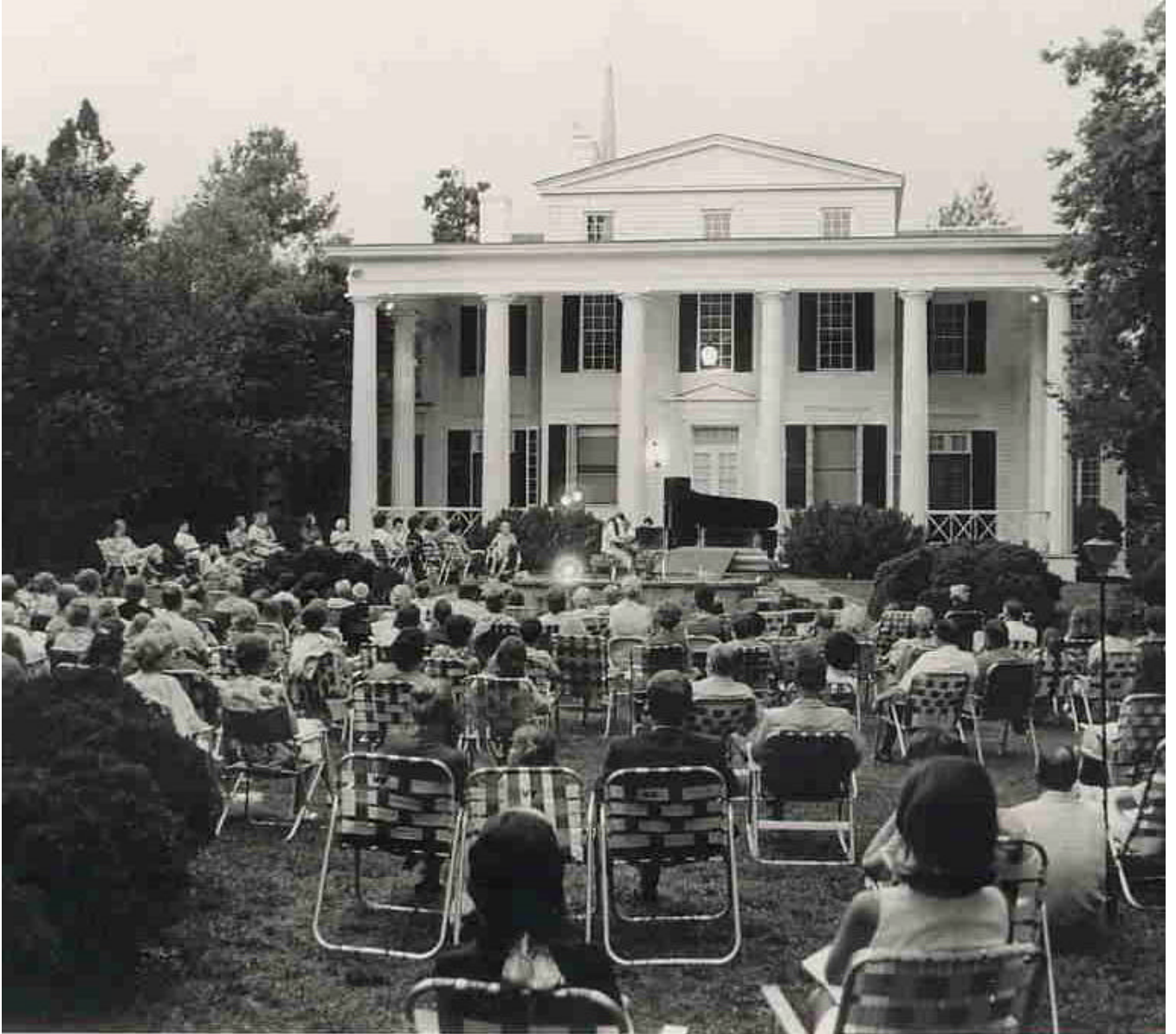
“Evenings in the Appleby Gardens.”