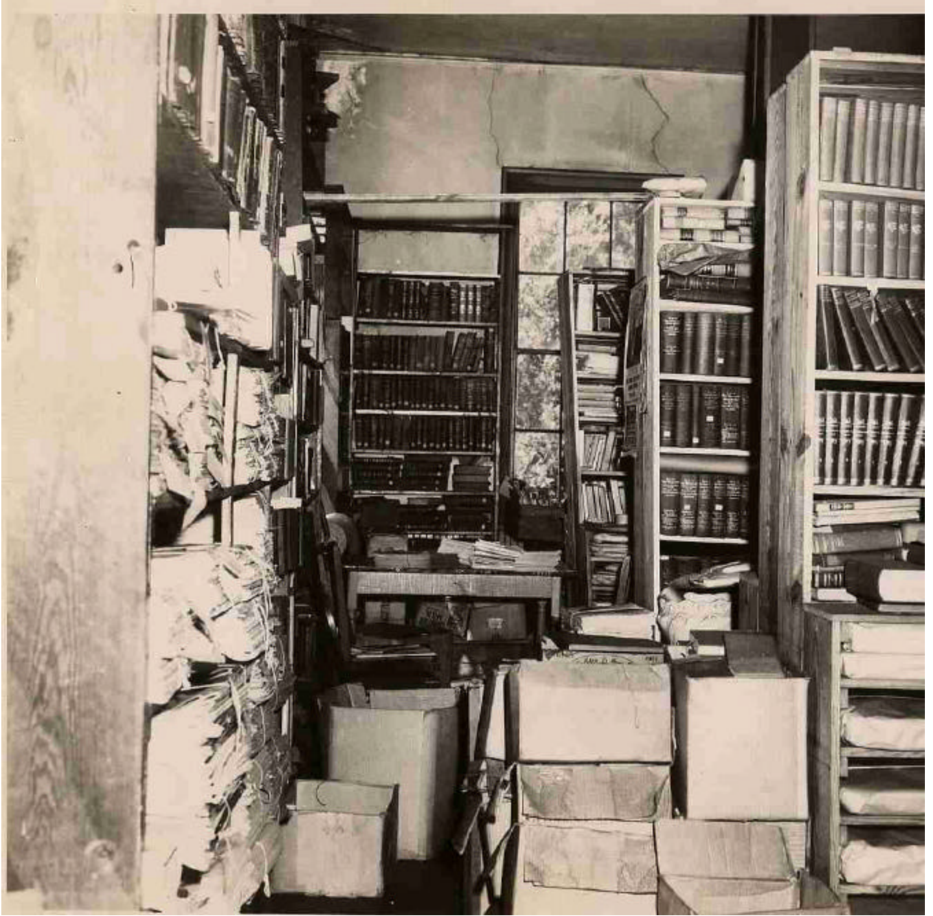
Library Storage Room, circa 1950.

At this time, the Library was located at 540 Telfair Street. The building was dilapidated and crowded. “Standing dormant on its shelves were many books which had not been circulated in thirty years, and, out of sight in the ‘famous locked room’ was a