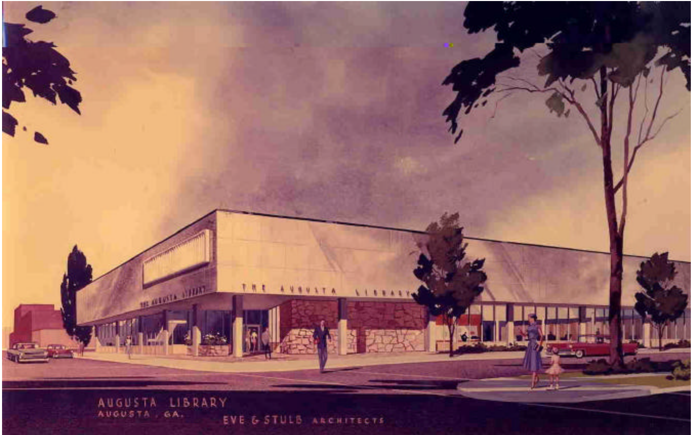
AUGUSTA LIBRARY AUGUSTA, GA. EVE & STULB ARCHITECTS