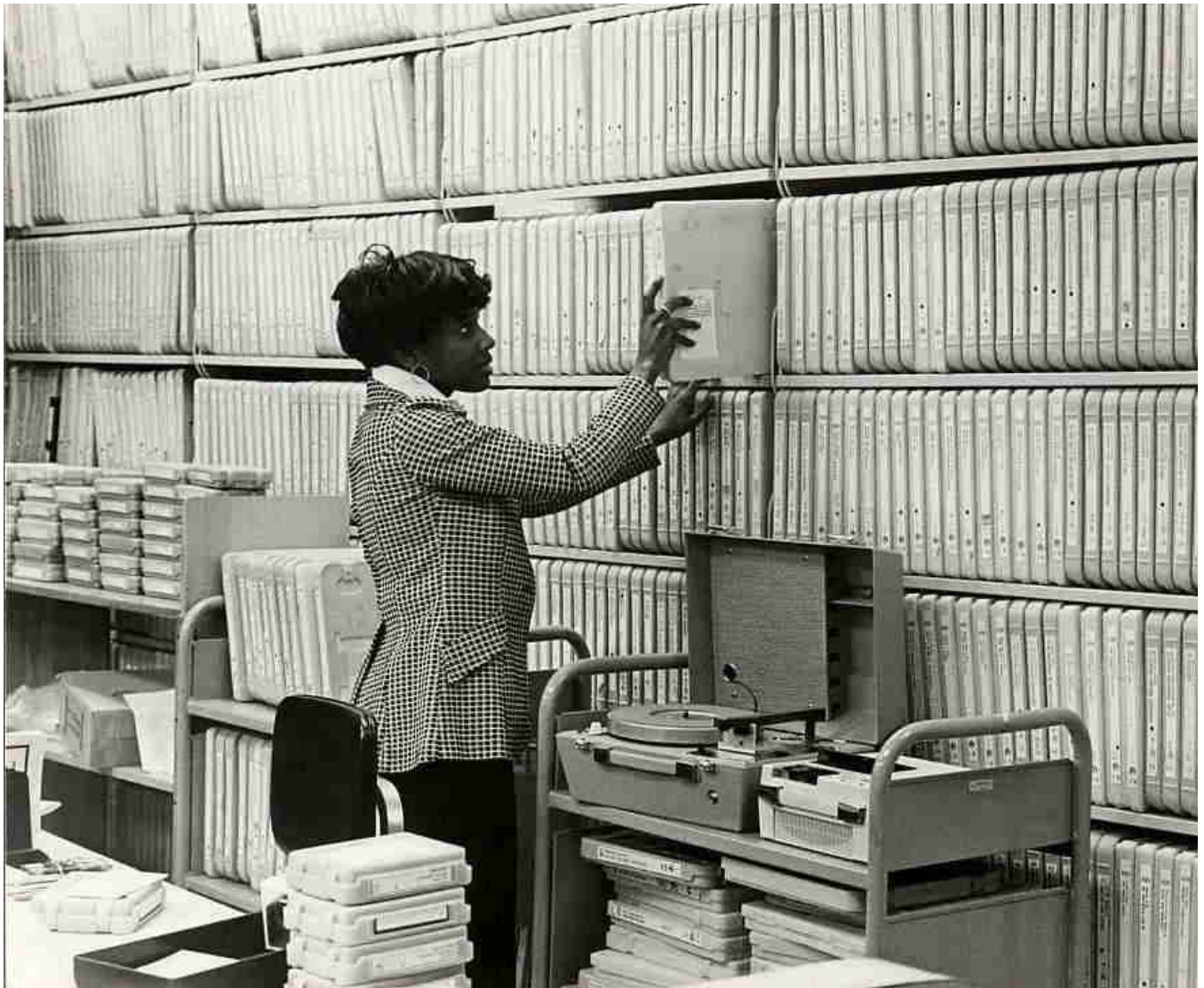
The Talking Book Center.

Board. This branch opened for service in February 1973 and is still open today. In October 1973, the Talking Book Center opened to serve the blind and physically handicapped in the Augusta Region and Jefferson County Library areas. The Talking Book Center is also the Library's Audio-Visual Center.