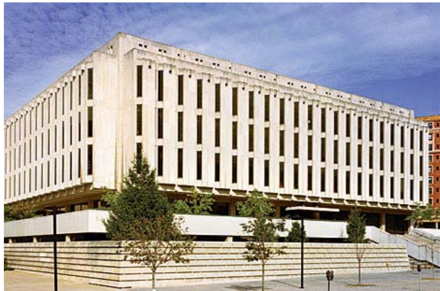
Hillman Library ( http://www.umc.pitt.edu/tour/tour-075-photo.html )

The library, built in the 1960s, has never been noted for its architectural warmth and charm. But with its 1.5 million volumes, 200 computing devices, special collections, rare books, manuscripts, photographs and cafe, it gets a heavy workout from students, faculty and scholars.