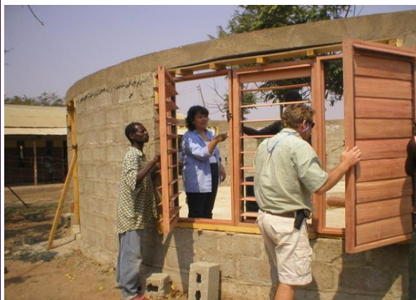
Photos taken at the construction site in September, 2006, show the walls, floor and windows of the first Lubuto Library, at the Fountain of Hope in Lusaka, Zambia, beginning to take shape.

The diversity of sessions and topics offered at the conference is truly amazing: over 300 sessions and programs. A number of sessions and events are scheduled for newcomers, both to ALA and to the conference itself. The organization makes a special effort to welcome, orient and include new members with “Conference 101” programs such as New Member Roundtable (NMRT) sessions, introductory sessions for special interests including American Association of School Librarians (AASL) 101, Association of College and Research Libraries (ACRL) 101, Association for Library Collections and Technical Services (ALCTS) 101, and Public Library Association (PLA) 101: ALA Annual Conference for First Time Attendees, among many others. The NMRT also hosts a “Meet and Greet,” a student reception, and the NMRT Social. Below are a few of the personal experiences and highlights reported by some of our own USC SLIS ALA 2007 conference attendees.